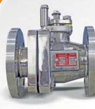
Full Bore Ball Valve