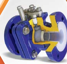
STD Bore Ball Valve