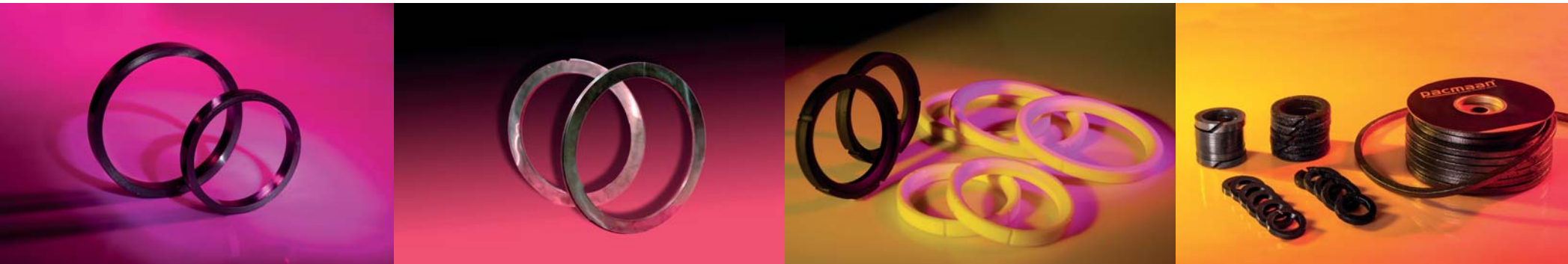
JD Jones offers a vast range of seals and packings which are used in widespread applications across a myriad of industries.