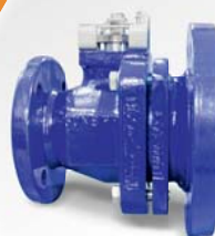
Ball - Drain Valve