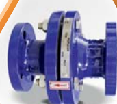
Ball Check Valve