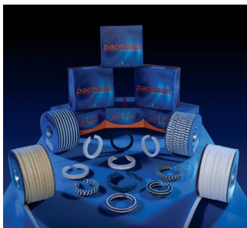
From PTFE to graphite and from carbon fibre to wire mesh jacketing, JD Jones is without doubt an all-round materials professional.