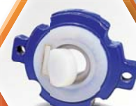
Swing Check Valve