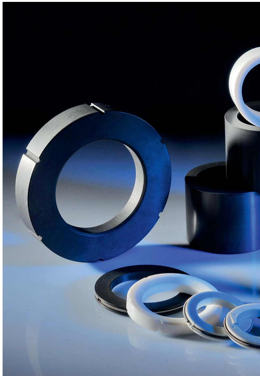
JD Jones has forged win-win partnerships with many leading valvemakers.